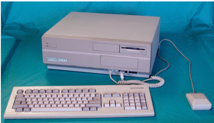
A2000. Mine had a 68040@25MHz. 12MB of memory